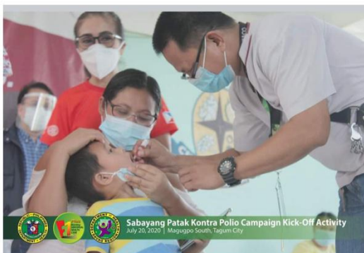
Sabayang Patak Kontra Polio Campaign Kick-Off Activity July 20, 2020 | Maguggo South, Tagum City