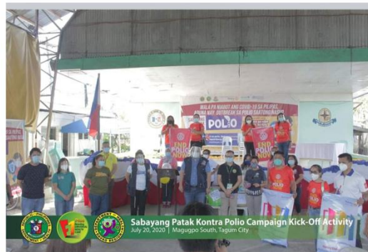
Sabayang Patak Kontra Polio Campaign Kick-Off Activity July 20, 2020 | Maguggo South, Tagum City